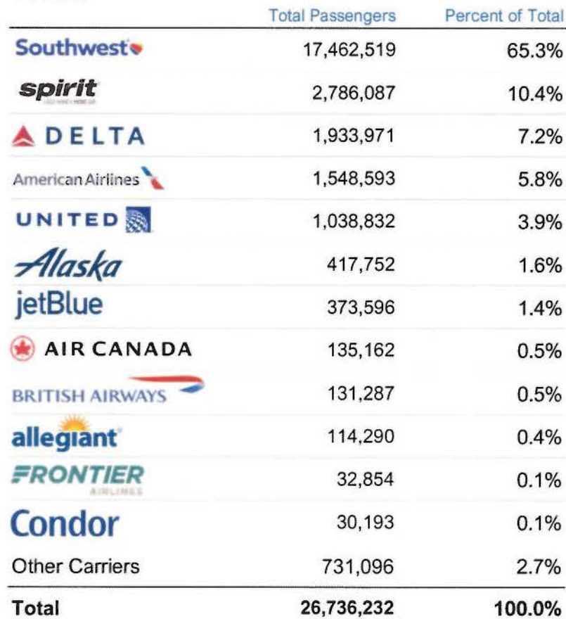
Table ii.1: Total Passengers by Airlines FY 2019

The sections that follow present MDOT MAA's responses to suggested guidelines for updating the initial 2014 Competition Plan Update ("2014 Update") for the Airport, as outlined in the FAA's Airport Competition Plans document dated November 2010 (appended 2014). No issues were specifically discussed in the FAA's Competition Plan Update approval letter dated August 25, 2014 that need to be included in this update.